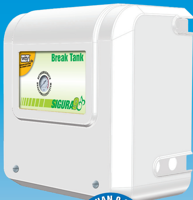
Sigura 9 with cover