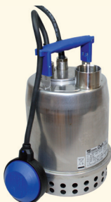
Provedo B-1 with loose float switch and direct suction 170 l/min, 9 m delivery head