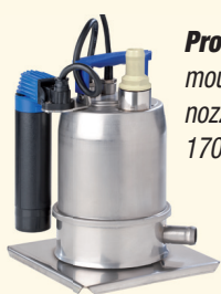
Provedo VX with fixed mounted level switch, nozzle and base plate 170 l/min, 9 m delivery head

Single-stage submersible feed pumps, e.g. as a loading pump for the Optima or Maxima rainwater units. With permanently mounted level switch or loose float switch. For pumping clean water, e.g. from rainwater storage tanks. Optional connection of fixed or floating suction filters. With 1" hose nozzle or 1 1/4" threaded connection (IG) or direct suction.