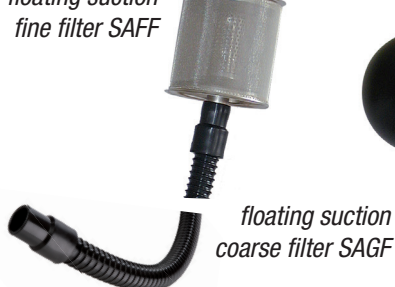
floating suction coarse filter SAGF

Suction hoses in various lengths from 0.5 to 3 m