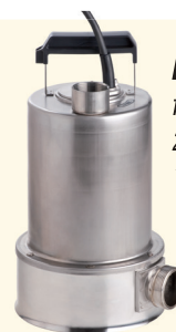
Provedo 2,3,4 for large systems: 280-350 l/min, 12-17 m delivery head