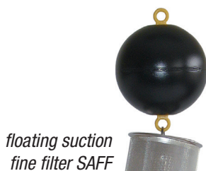
floating suction fine filter SAFF

normal suction, multistage submersible pressure pump