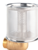
fixed mounted suction fine filter FAFF