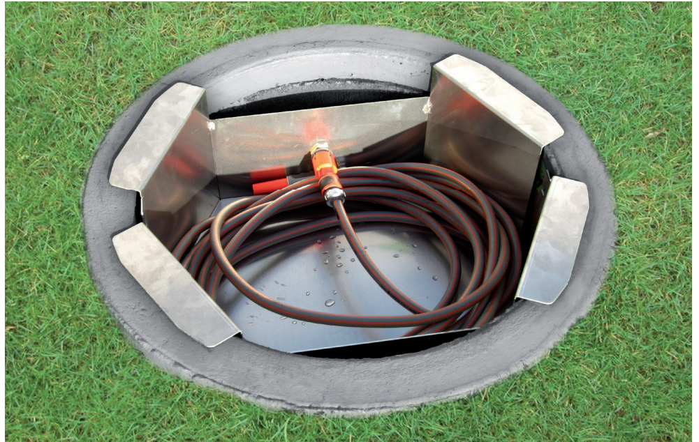
▲ Hose storage with open cover