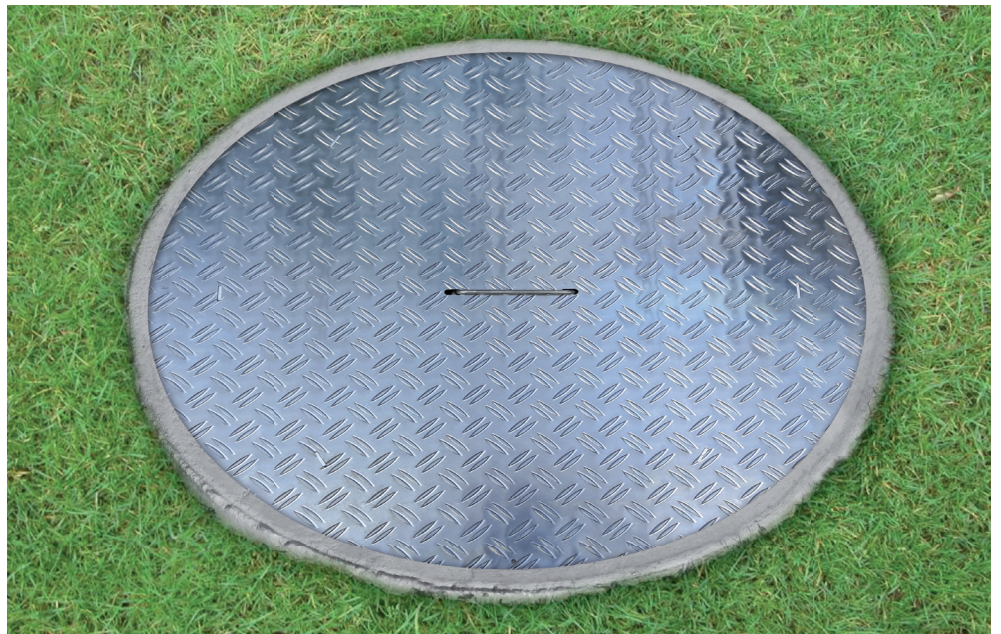
Cover is passable on feet ▼